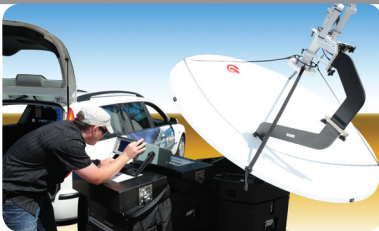
Gigasat uplink, NZRB