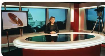
BBC Washington, News Bureau