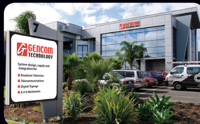
Gencom Technology Head Office, Design Centre & Factory, Auckland, NZ

Visit the Gencom Technology website to find your nearest office and for further information - www.gencom.com