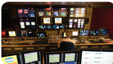
ESPN Star Sports, HD Studio